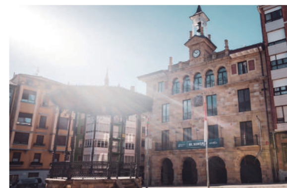
The town hall