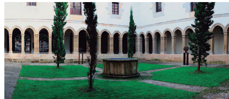
Church and Cloister of St. Francisco

The Bermeo coat of arms provides us with a lot of information: