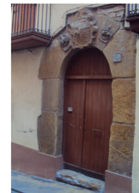
Houses in Doniene Street