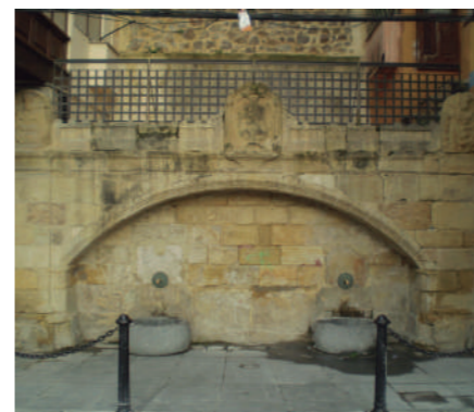
The Two Fountains