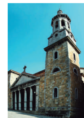
Church of St. Maria