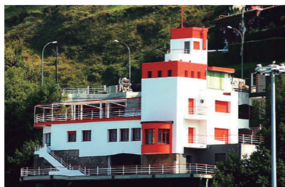
View from Gaztelu (Kikunbera house)