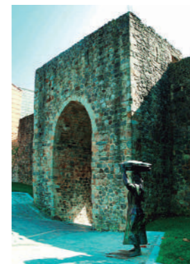
St. Juan's Arch