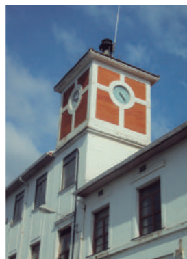
The Old Guild