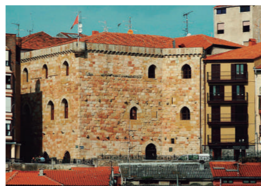
Ercilla Tower / Fisherman's Museum