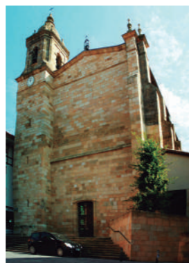
Church of Saint Eufemia